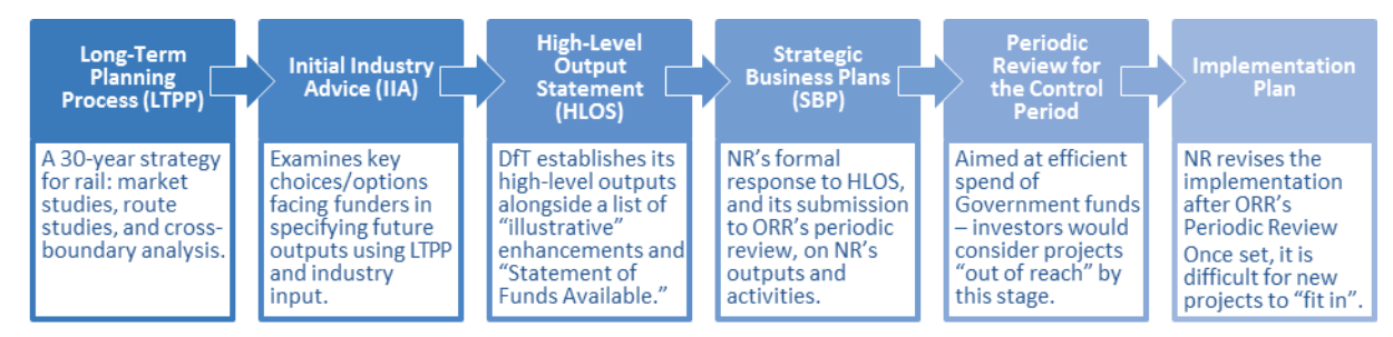
Figure 3: Current control period enhancements process (under review for PR18)

Projects are also routinely developed outside of this process – most notably mega-projects such as Crossrail, and rolling stock procurements (Intercity Express Programme, and Thameslink) procured by the Department for Transport (DfT). Additionally, enhancements are sometimes included within franchise agreements and the Office of Rail and Road's (ORR) existing investment framework has also been used. However, the overall value of these