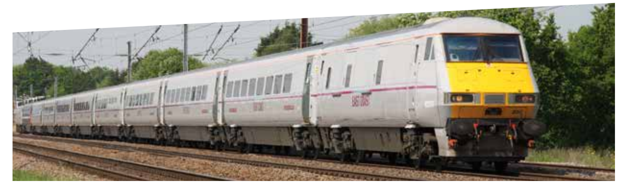
A BR-procured East Coast Type F 'IC225' electric trainset of 1989