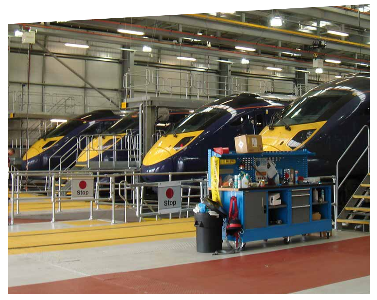
Hitachi Southeastern Type G class 395 HS1 EMUs of 2006