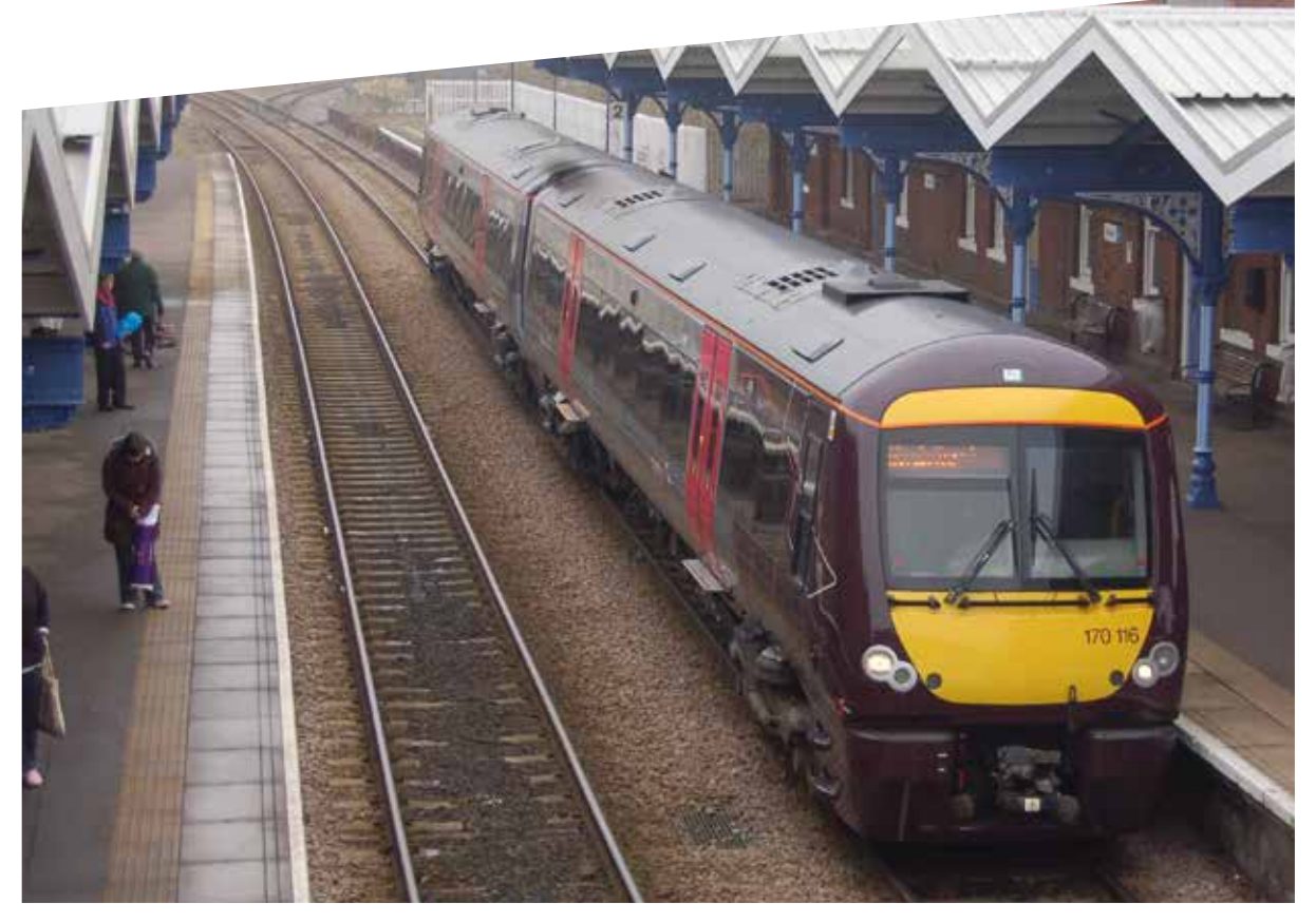
Bombardier CrossCountry Type B class 170 'Turbostar' DMU of 1998