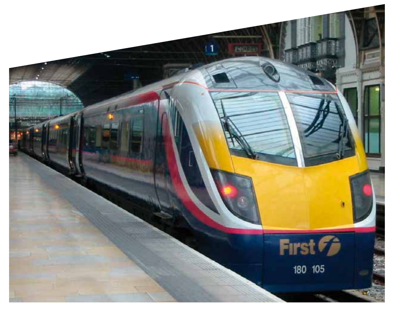
An Alstom FGW Type C class 180 'Adelante' DMU of 2000