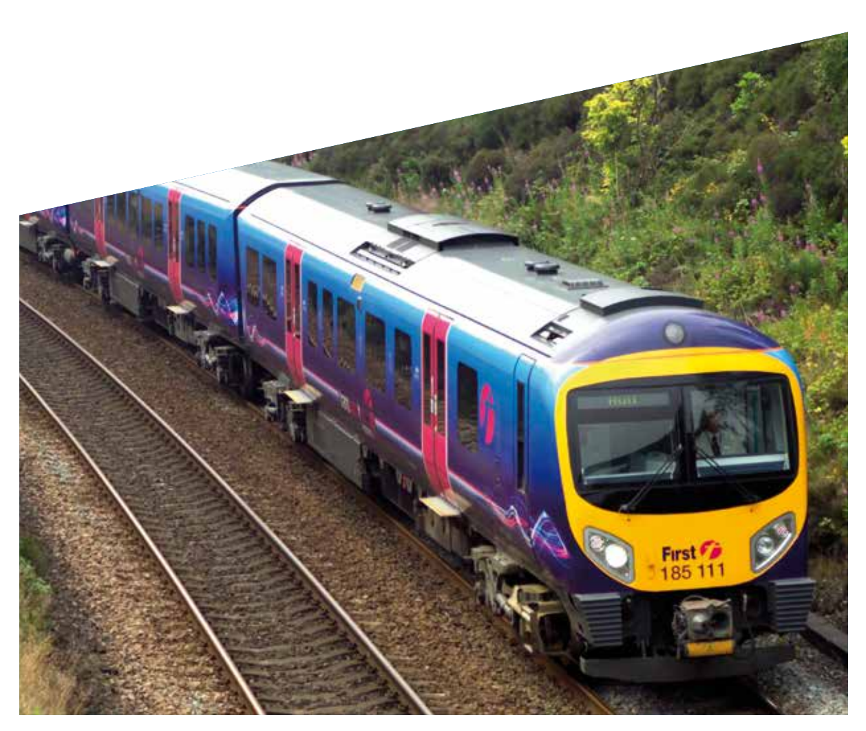
A Siemens FTPE Type B class 185 'Desiro' DMU of 2005