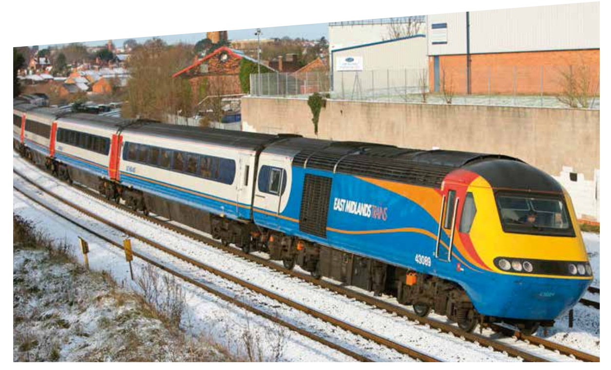
BR-procured EMT Type C 'IC125' HST built in the late 1970s