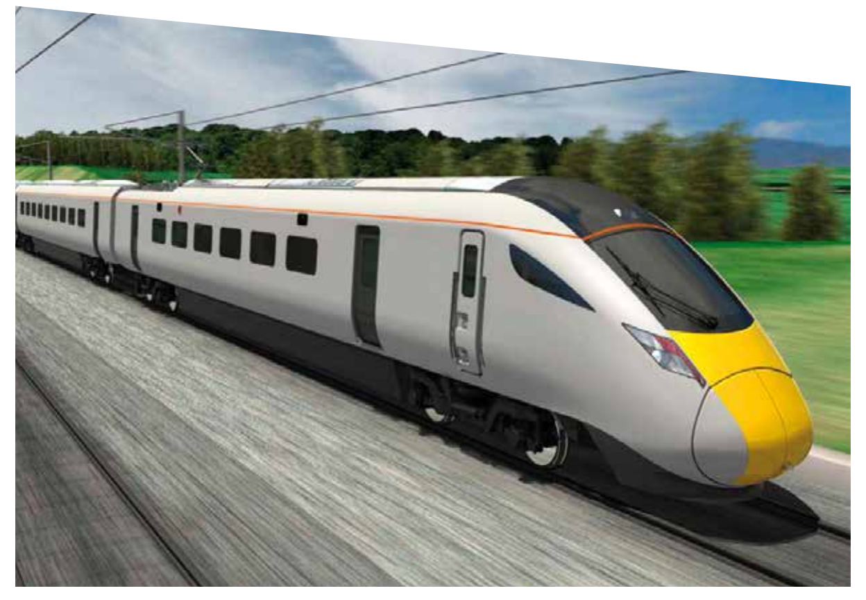
Hitachi Type F class 800 electric and bi-mode 'Super Express Trains' to be introduced on the Great Western and East Coast routes from 2017