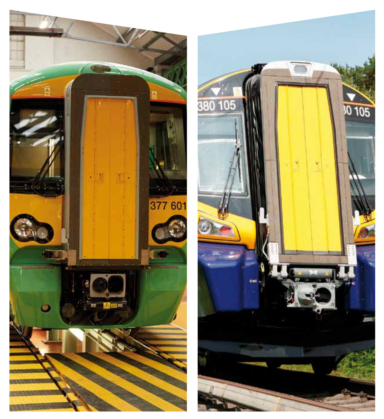
Type E EMUs: A Bombardier Southern class 377/6 'Electrostar' of 2013, and a Siemens ScotRail class 380 'Desiro' of 2009

• full service maintenance provision by the manufacturer can in their view produce a better train, but typically needs a maintenance contract period of around 10 years to justify the investment required.