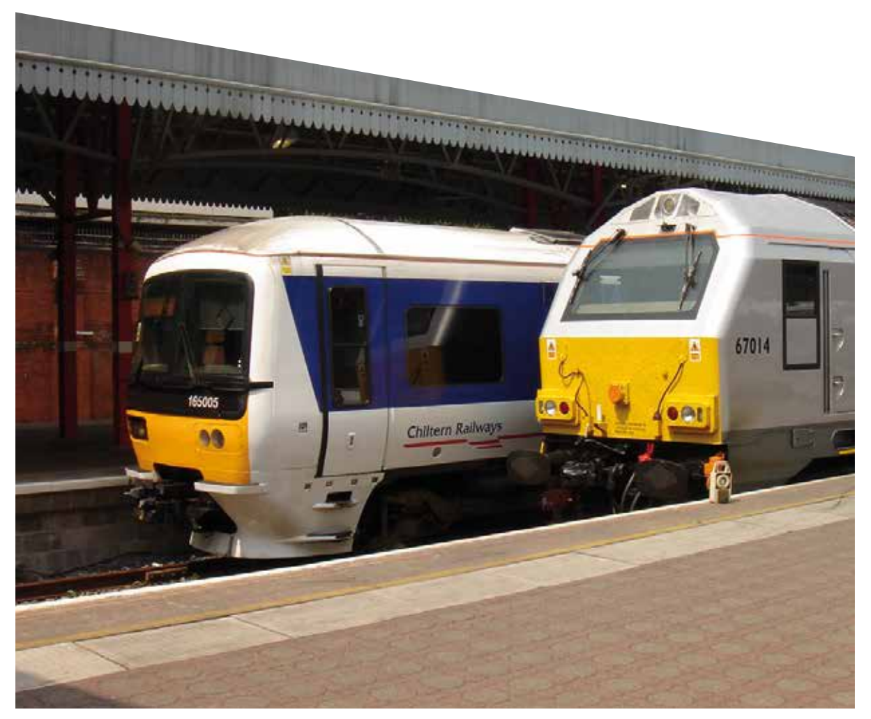
Chiltern Railways diesel trains: A BR-procured Type A class 165 'Network Turbo' DMU of 1991, and an Alstom/General Motors Type B Class 67 locomotive of 1999